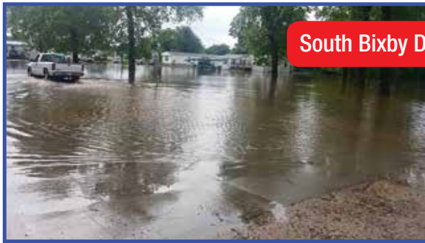
South Bixby Drainage Upgrades