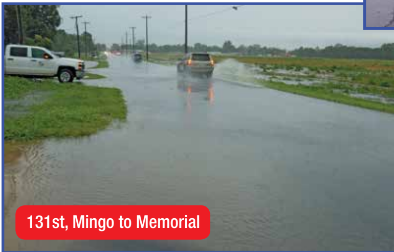
131st, Mingo to Memorial