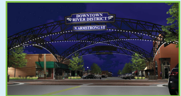
Downtown River District crosswalk